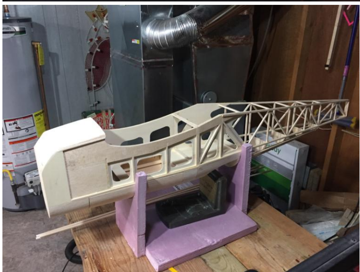
Modified SIG 1/4 scale Spacewalker