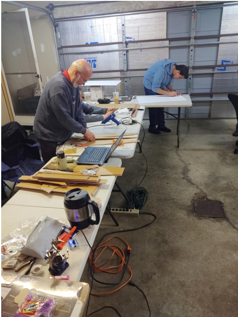
Photos from the first build day